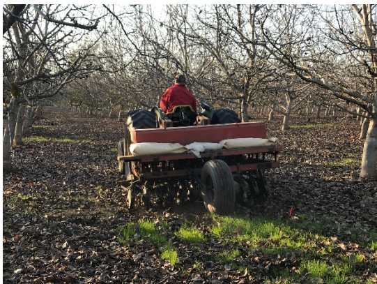
Fig5. Drilling cover crop seed into walnut leaf litter, Fall 2017.