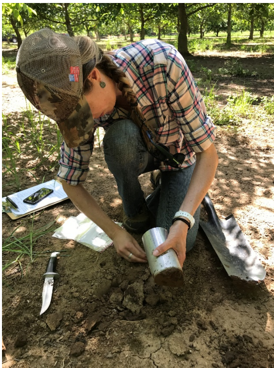
Fig4. PMC staff collecting bulk density samples, Spring 2017.

Improvements in soil health properties were detected after 3 years of implementing cover crops. The Brassica Mix and triticale cover crop treatments were able to increase infiltration rates, reduce bulk density and increase soil porosity, which would help reduce runoff. The Brassica Mix was also able to increase the soil organic matter content. Brassica and cereal cover crops can have other benefits including scavenging nutrients that would otherwise be leached and lost and help in alleviating soil compaction with their unique root systems. The APDM and Experimental Mixes increased infiltration rates and the organic matter content of the soil. They also produced large amounts of green manure and will likely increase nitrogen availability for the tree crop. All four treatments provided some improvements to soil health after just three years of implementation indicating that cover cropping, even for a short period of time, can lead to soil resilience and contribute to long-term walnut orchard health. At the end of the cover crop demonstration, the producer was pleased with the results and has decided to implement cover crops into all of his walnut orchard operations.