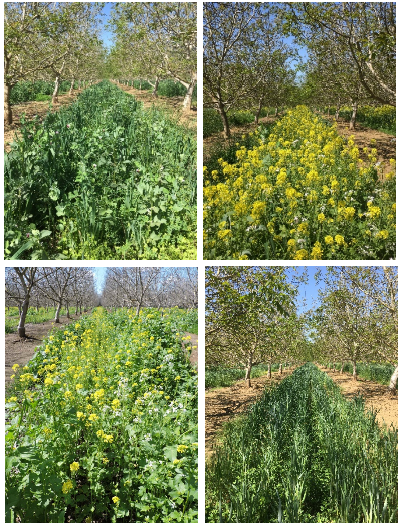
Fig6. Four walnut orchard cover crop treatments. Top left to right: A) Annual Plow Down Mix, Spring 2018; B) Experimental Mix, Spring 2018; C) Brassica Mix, Spring 2020; D) Triticale, Spring 2018.