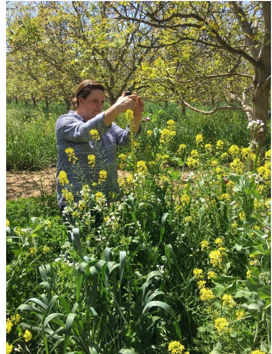
Fig. 1. Field office staff evaluating cover crops in Spring 2018.